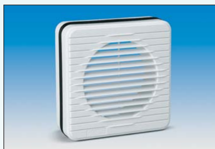
Window kit including fixing screws for installation on window (5 mm).