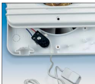
Standard 10 Pull Cord, switching on/off of the fan through a pull cord.